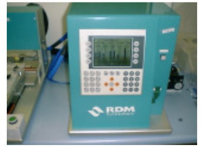
Separate control tower