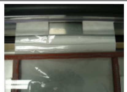
Pouch in place over tong which provides Flushing and vacuum draw.