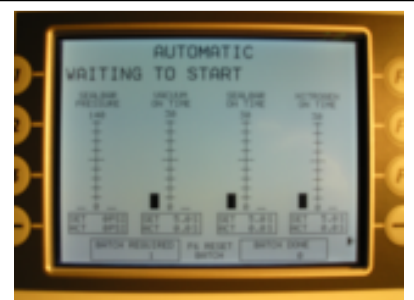
Main screen with bar scale for temperature, pressure and dwell time, flush and vacuum cycles