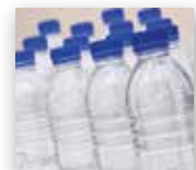
Test Multiple Samples