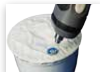
Retort & Opaque Packages