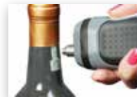
Headspace & Permeation