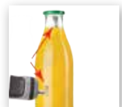
Dissolved Oxygen and Total Package Oxygen