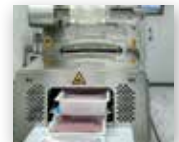
MAP & Quality Control